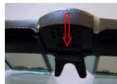
Close the cover