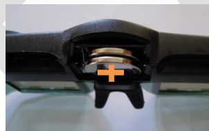
Remove the old battery and put 2 new ones