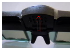
Open the cover

The battery level can be measured with a voltmeter and each CR 2032 battery should be 3V. Extra